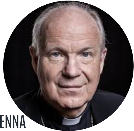
CHRISTOPH SCHÖNBORN CARDINAL ARCHBISHOP OF VIENNA

I have had contact with Youth with a Mission for years and have been personally involved with Kerygma members for over 20 years. Catholics here in Austria have been enriched by Kerygma's ministry and I support their efforts with enthusiasm.